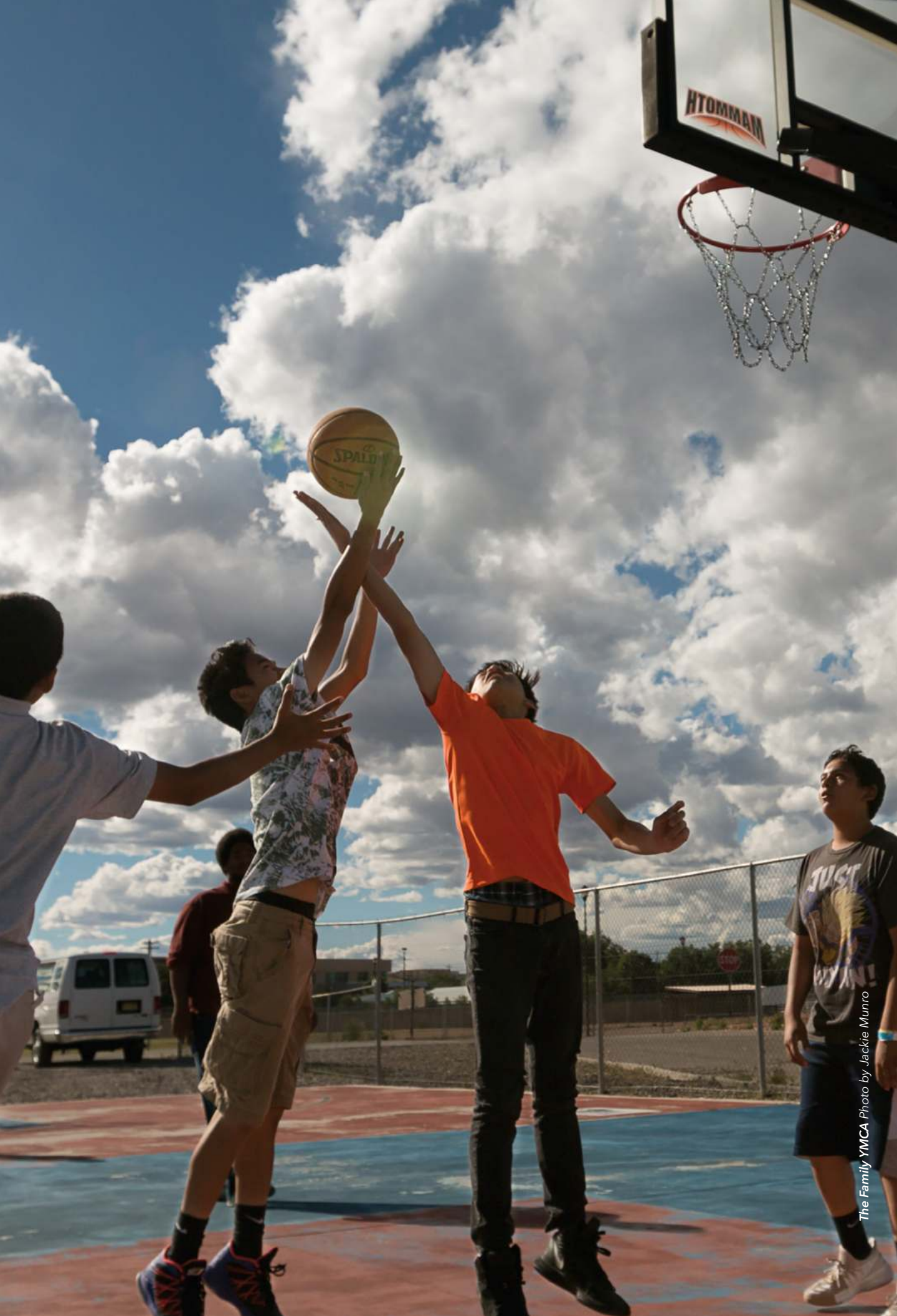
The Family YMCA