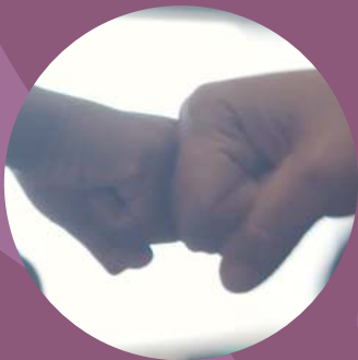
New Mexico Alliance for School-based Health Care

“Our association was established to collectively improve health care for New Mexicans by advocating for our members and empowering them through education. Certification for community health workers has been a collaborative process among many different partners, including the Con Alma Health Foundation.”